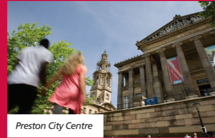
Preston City Centre