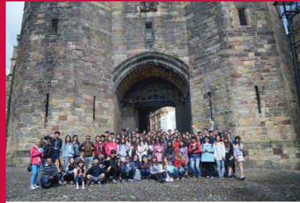
Language Academy students at Lancaster Castle

Additional and subject to availability: priced per trip