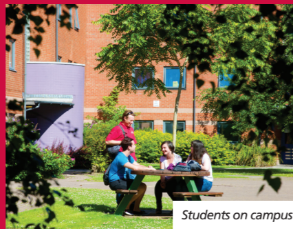
Students on campus