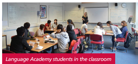
Language Academy students in the classroom

languageacademyuclan Email: languageacademy@uclan.ac.uk Telephone: +44 (0)1772 893119