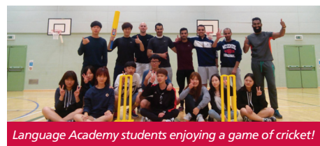
Language Academy students enjoying a game of cricket!