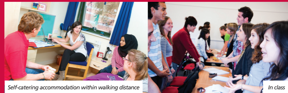
Self-catering accommodation within walking distance