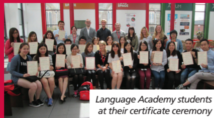
Language Academy students at their certificate ceremony

For further information, please contact us via